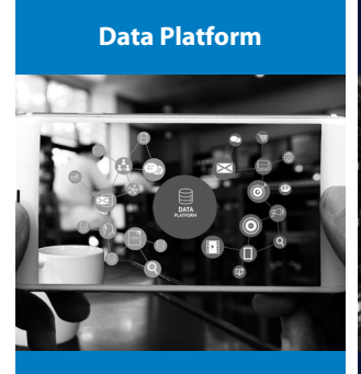
Enterprises can land all their owned and 3<sup>rd</sup> party data in one platform